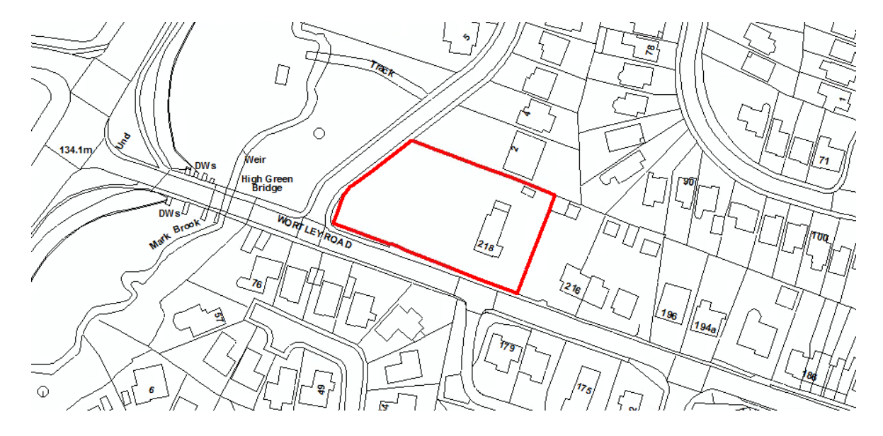
© Crown copyright and database rights 2016 Ordnance Survey 10018816